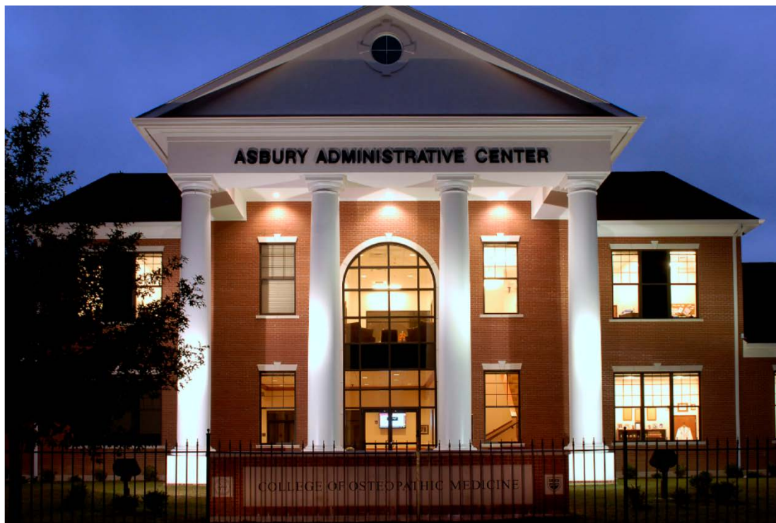
WCUCOM Asbury Administrative Center

All inquiries regarding the WCUCOM Student Handbook and Catalog should be directed to the Office of the WCUCOM Associate Dean, Student Affairs at 601.318.6290. Any recommendations for additions, deletions, or changes must be submitted in writing to the WCUCOM Dean. Final approval is made by the William Carey University (WCU) Board of Trustees (BOT) based upon recommendations from the WCU President. In the event of a discrepancy between the WCUCOM Student Handbook and Catalog and a WCU Policy or a WCU BOT Policy the latter policies will govern.